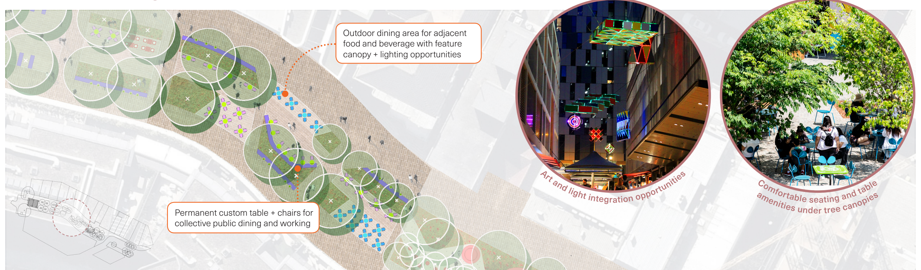
Proposed Concept Design of Outdoor Dining Pads in Knox Street Plaza