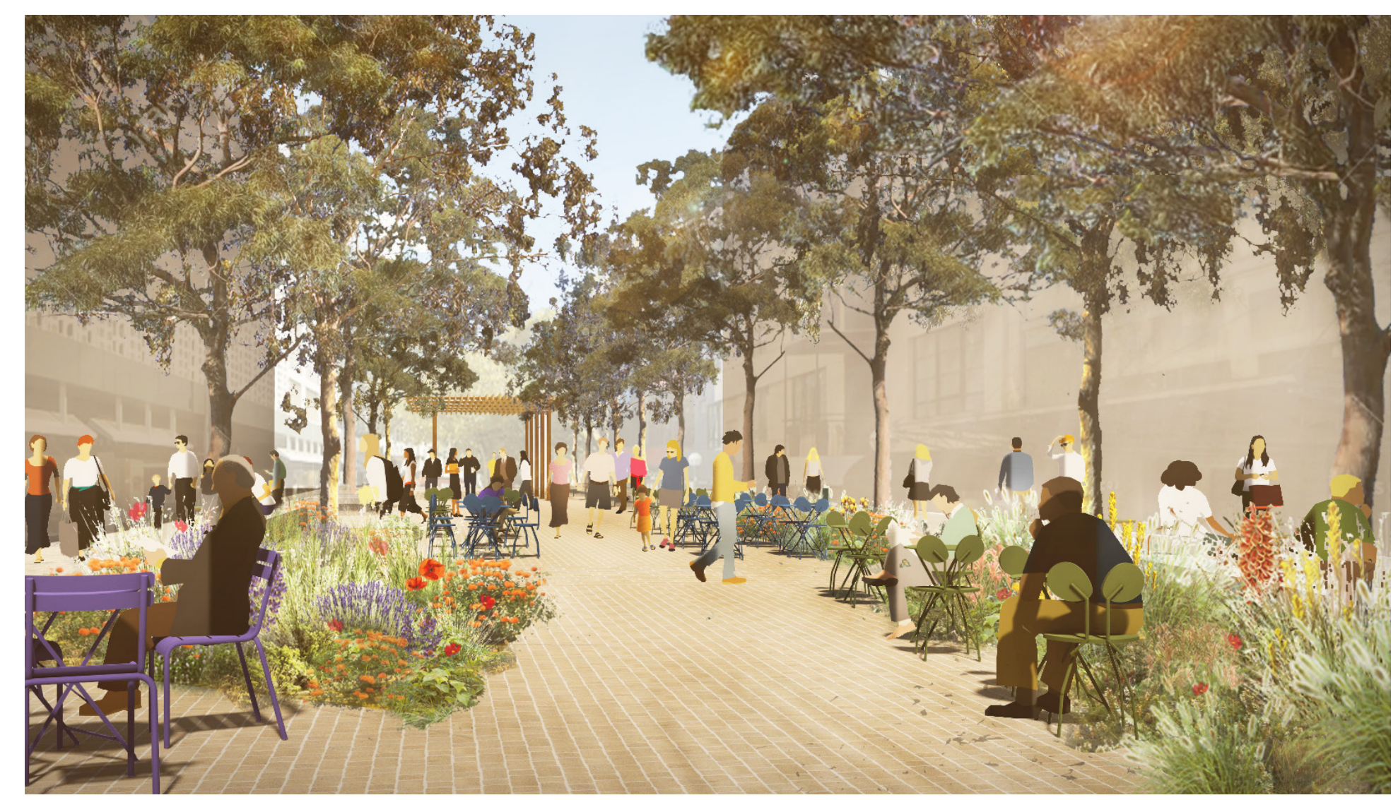
Illustrative perspective of Knox Street Plaza