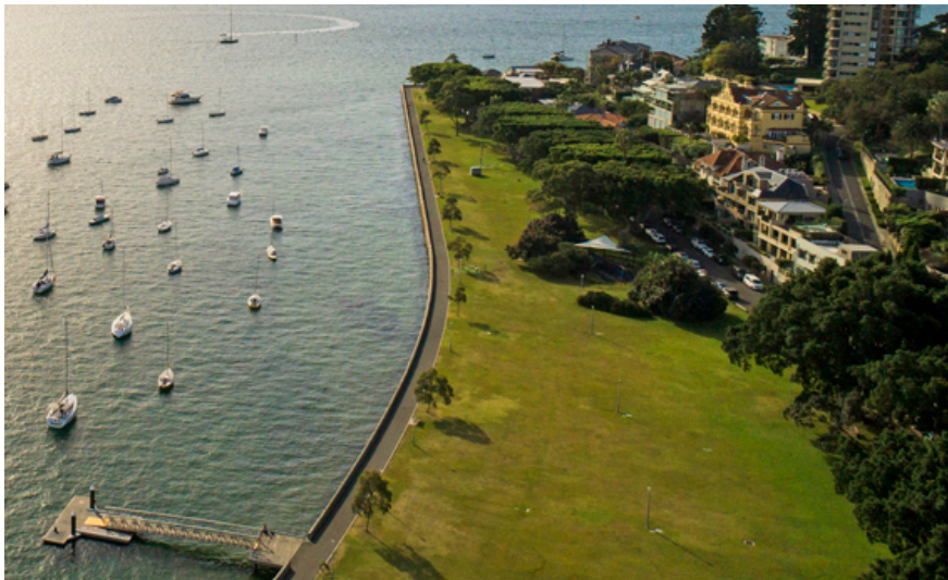
Yarranabbe Park, the site of a proposed skatepark.

🕒 Posted on 3 August 2021 by Daniel Lo Surdo in Bondi View Featured Bondi View · 0 Comments