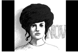
Murder mystery may soon be solved