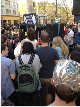
People take to streets to protest lockouts