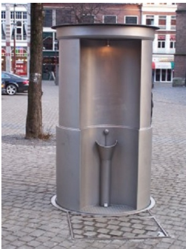
Outdoor 'Pissoirs' to come out on Oxford