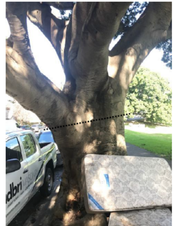
Hatched line indicates cross-sectional testing location. Photo facing south.