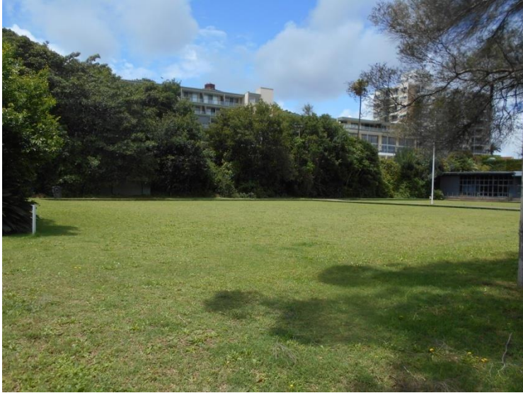
Looking north west